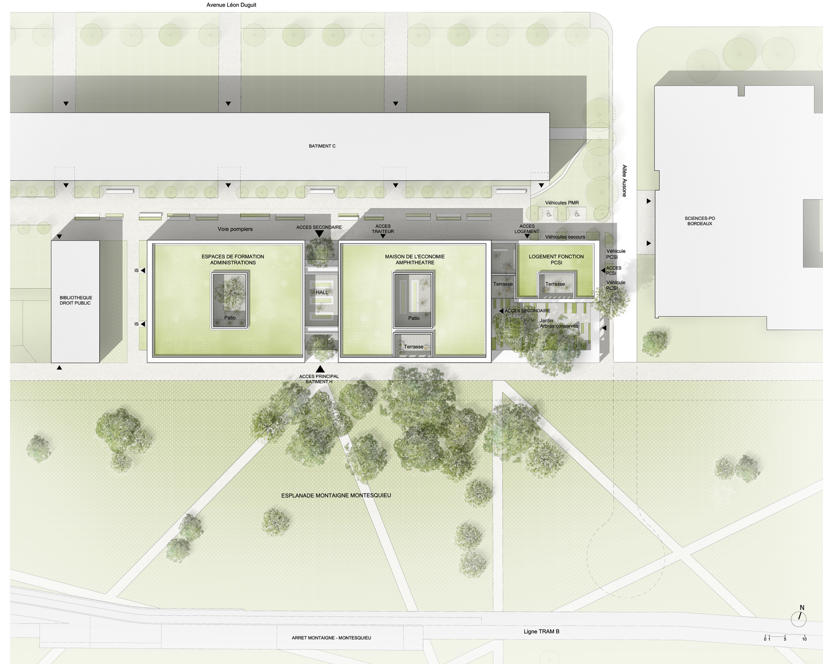
PLAN MASSE 1/500