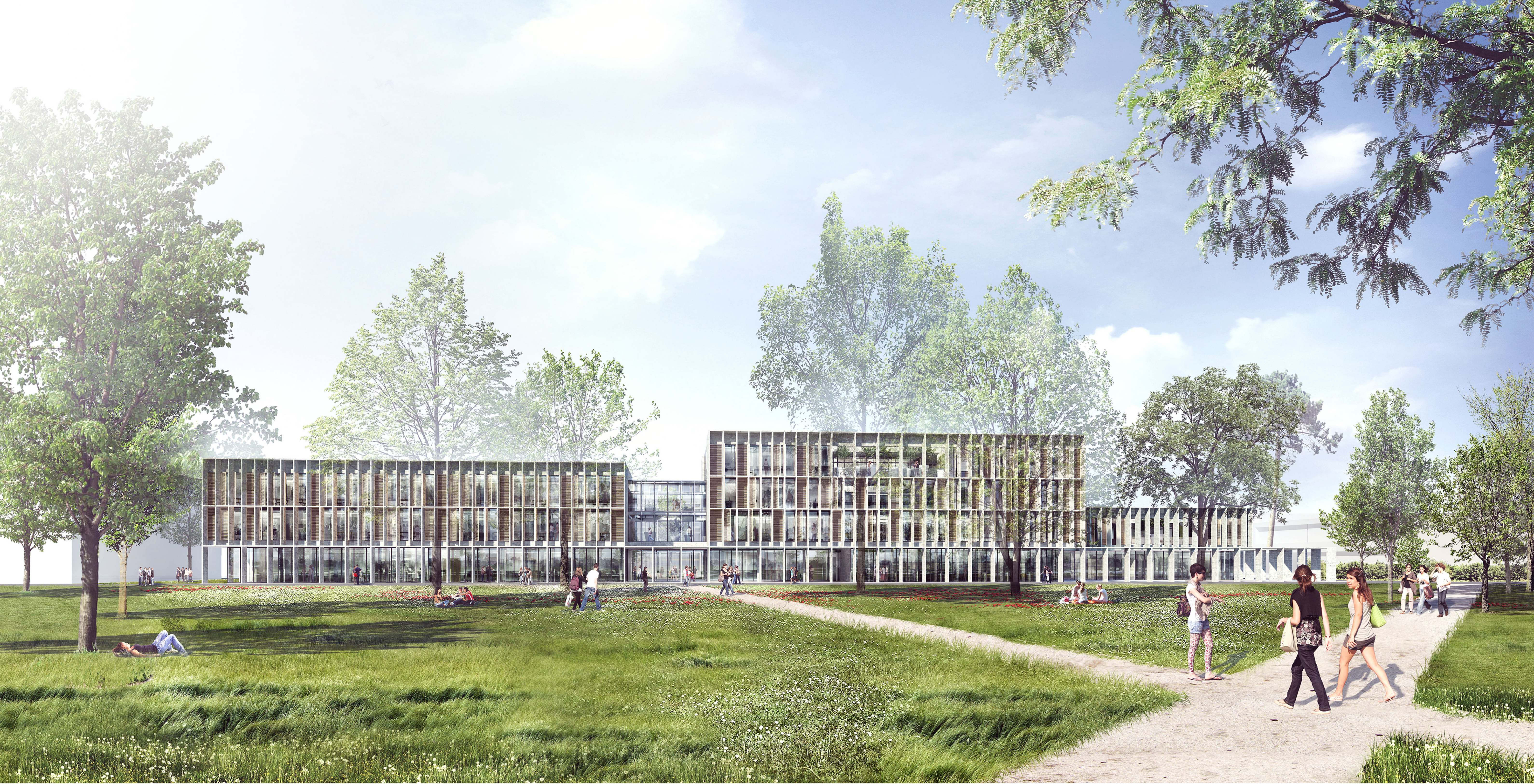
PERSPECTIVE DEPUIS LE TRAMWAY